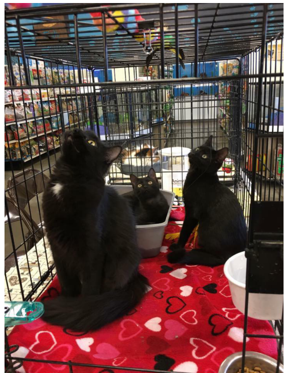
Volunteers spending a day at Petco and finding a fur ever home for these beauties.

If you have never been to Animal Aid Humane Society, and if you are in the area. I would like to extend a personal invitation for you to stop in during open hours.