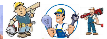
The Planned New Shelter

Things are starting to come into focus. First I would like to extend a great big thank you to all of our great volunteer for all their support. I would also like to wish all of those that adopted, donated, and volunteer a very happy holiday season. This year is quickly moving into a New Year. Yes, things such as the plan construction of our new shelter are on top of the list of things to get accomplished in the up coming year.